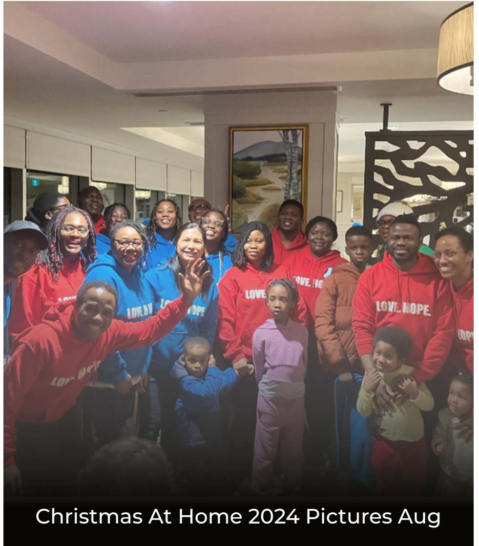
Christmas At Home 2024 Pictures Aug